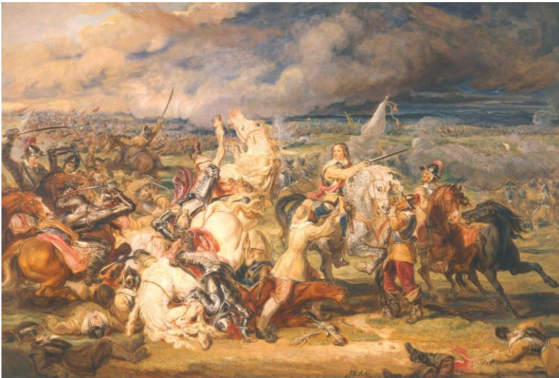
The Battle of Marston Moor 1644 painted by James Ward

A joint Day Conference organised by the Society for Lincolnshire History & Archaeology (SLHA) and The Cromwell Association